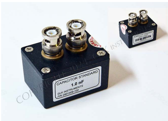
Figure 1. Capacitor Standard

The capacitor standard and its equivalent circuit are shown in Figure 1 and 2, respectively. The dielectric of all capacitors used in the standards is ceramic, type C0G. Each capacitor standard is housed in a metal case (L=2.0 in x W=1.5 in x H=1.2 in) and has internal thermal isolation to minimize rapid temperature changes during handling. The BNC terminals are on 0.750 inch spacing and are plug compatible with the connector spacing the Model 3000 Capacitance Meter. Each capacitor standard is serialized and bar coded for inventory control.